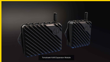
- "Tomahawk Kxm Expansion Module" add