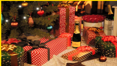
- "Christmas Gift" add