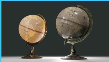
- "Desk Globe" Replacer