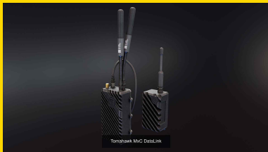
- "Tomahawk MxC DataLink" add