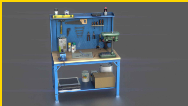
- "Workbench" add