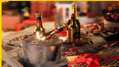
- "Champagne" add