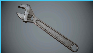
- "Wrench" Replacer