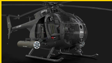
- "MH-6 Little Bird" add