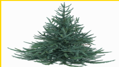
- "Christmas Tree" add