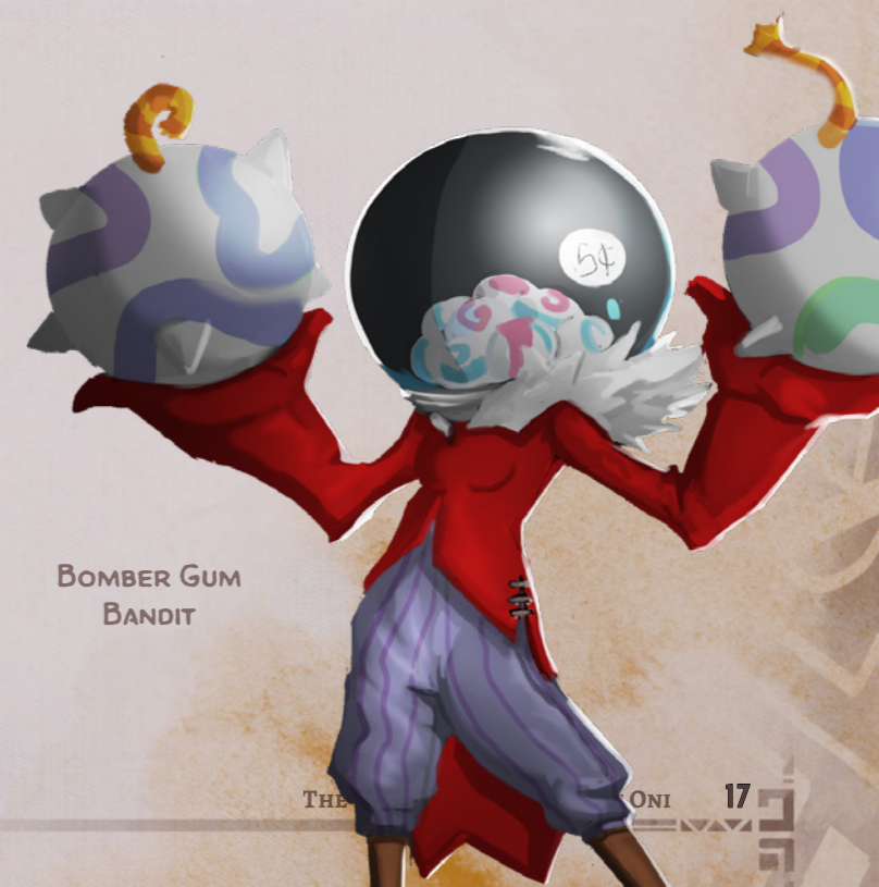
BOMBER GUM BANDIT