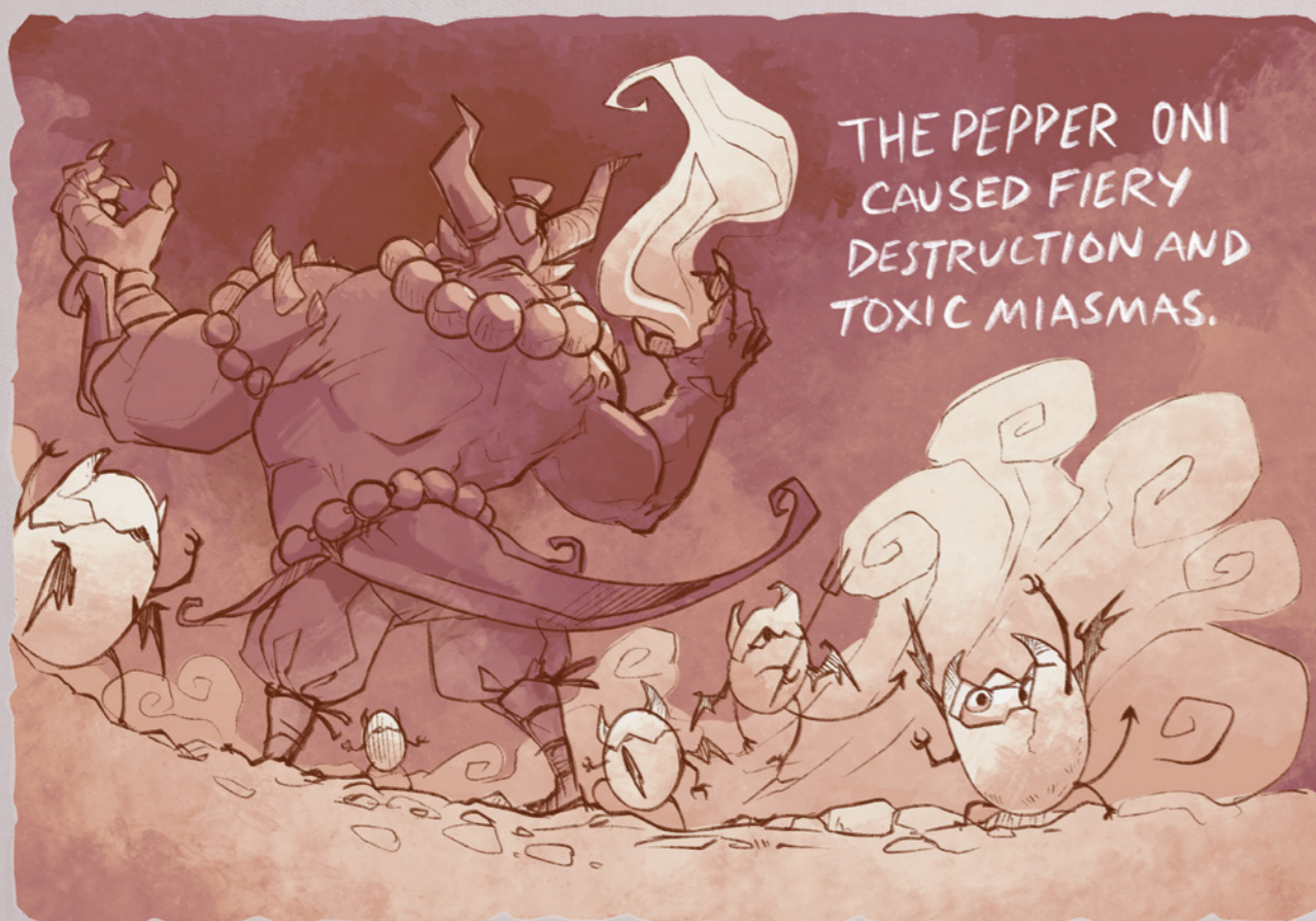
HANDOUT 3. FIENDISH IDOLS

“Scuse me,” comes a frail voice from under the floor. “Can I come out now?” A floorboard slowly lifts and the glassy, bulbous head of a timid gumball peaks out. “I think you might want this,” he says proffering a bejewelled statue, the weight of which his thin arms struggle to bear. “Before you kill me, I think there’s something you need to know...”