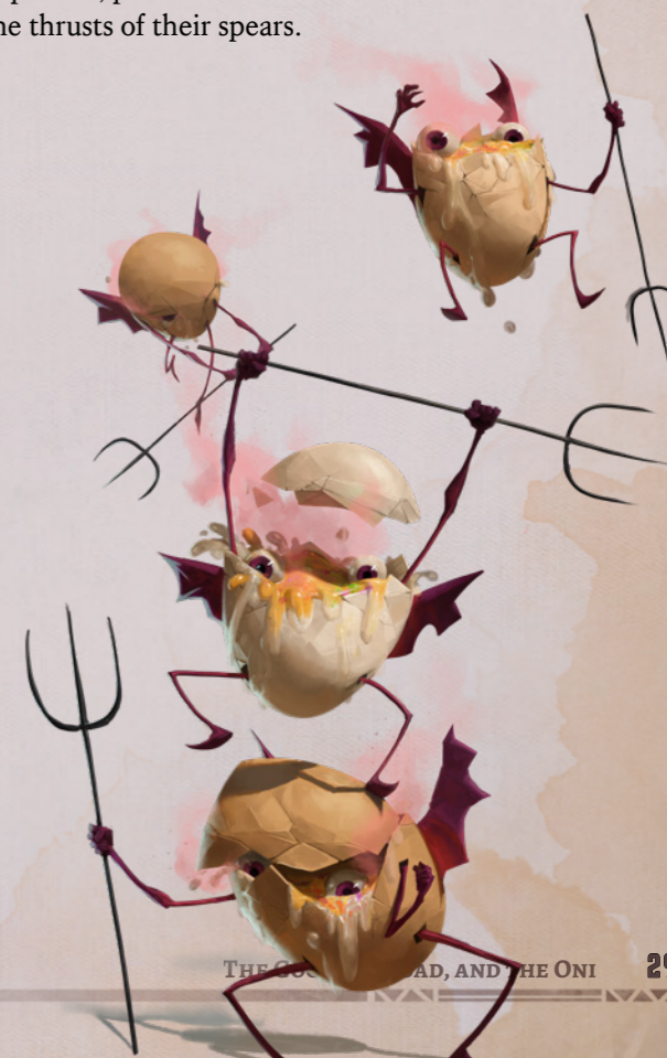
THE GUM BANDIT, AND THE ONI

Rank and File. Though individually fragile, massed deviled eggs can defeat even the most battle-hardened battalion, if not with their spears, then with their toxic, sulphurous stench. These putrefied foot soldiers follow a strict hierarchy; a deviled legion comprises ten 'crates', each of which contains six 'cartons', which in turn comprise 84 individual eggs, grouped into seven 'dozens'. Fiendish captains and generals care not for the life of an individual deviled egg; their explosive, poisonous deaths can be more lethal than the thrusts of their spears.