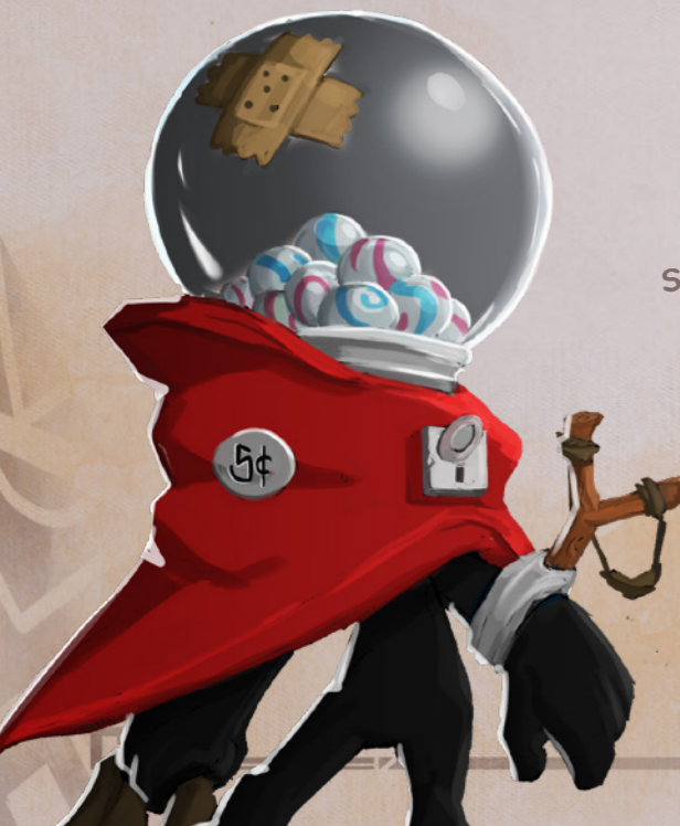
SNIPER GUM BANDIT

Wave 1 begins as soon as the Gum Gang attacks. Obsessed with the pepper oni's promises, they aren't keen to parlay and can't be persuaded or threatened to leave. They won't chase party members who run out of the mine, preferring to simply return to their work. Throughout the fight, the oni rages in its prison, causing occasional tremors that throw the combatants off-balance.