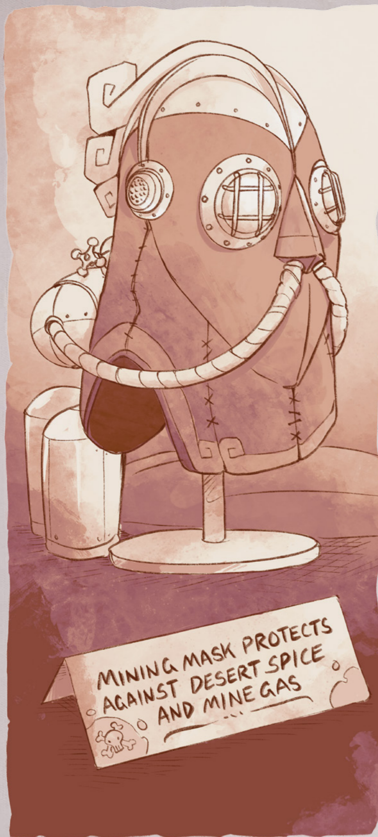
HANDOUT 1. MASKS