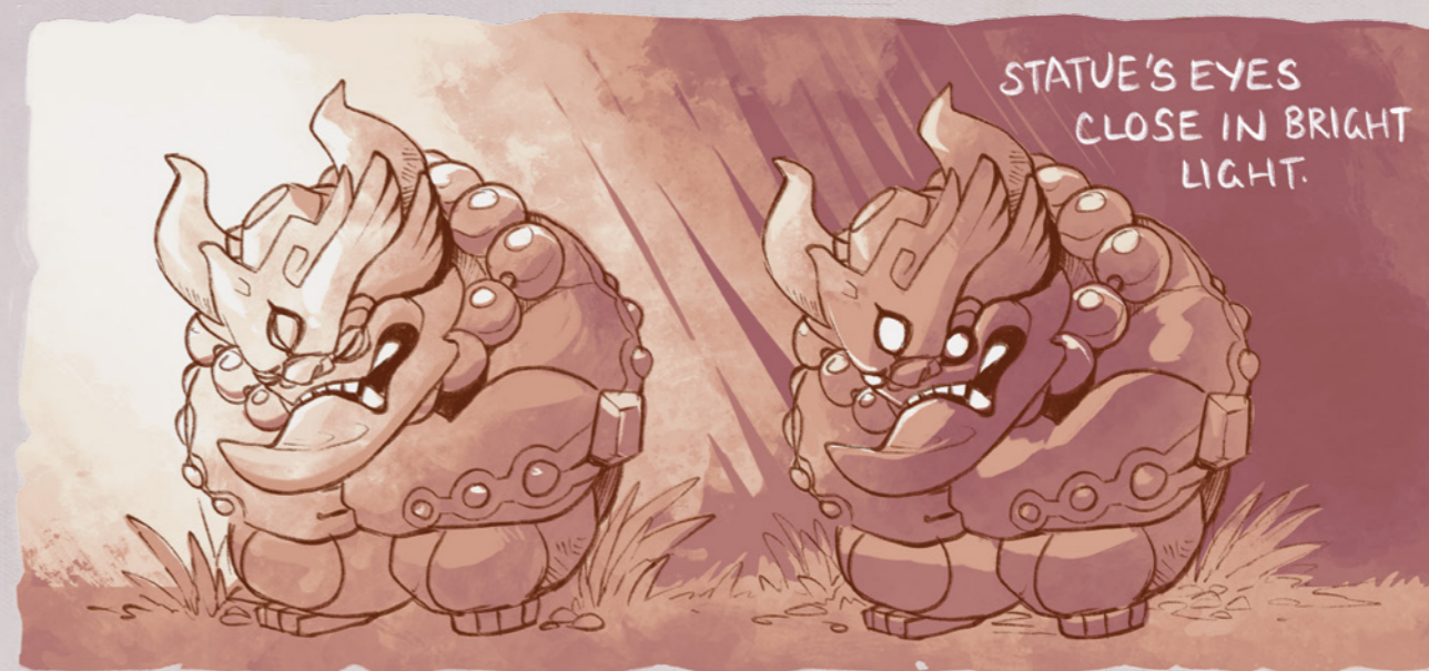
HANDOUT 2. BLIND ADULATION