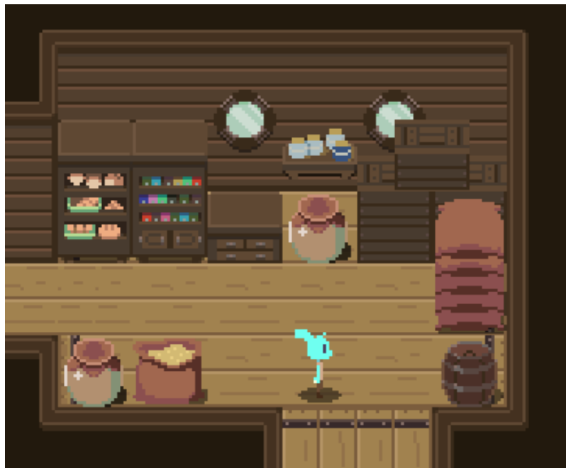
Pirate Ship dining room