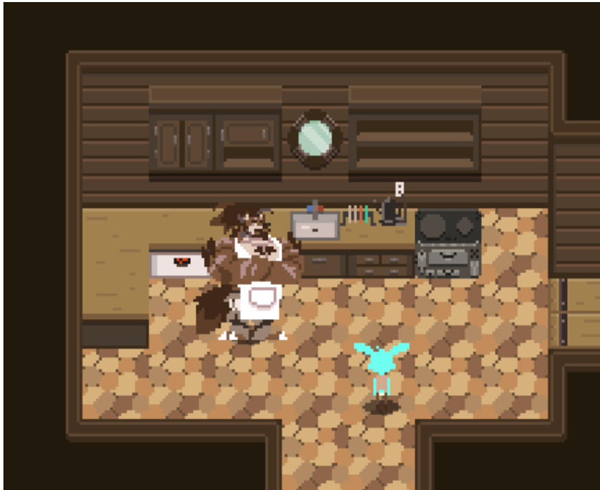
Pirate Ship Pantry