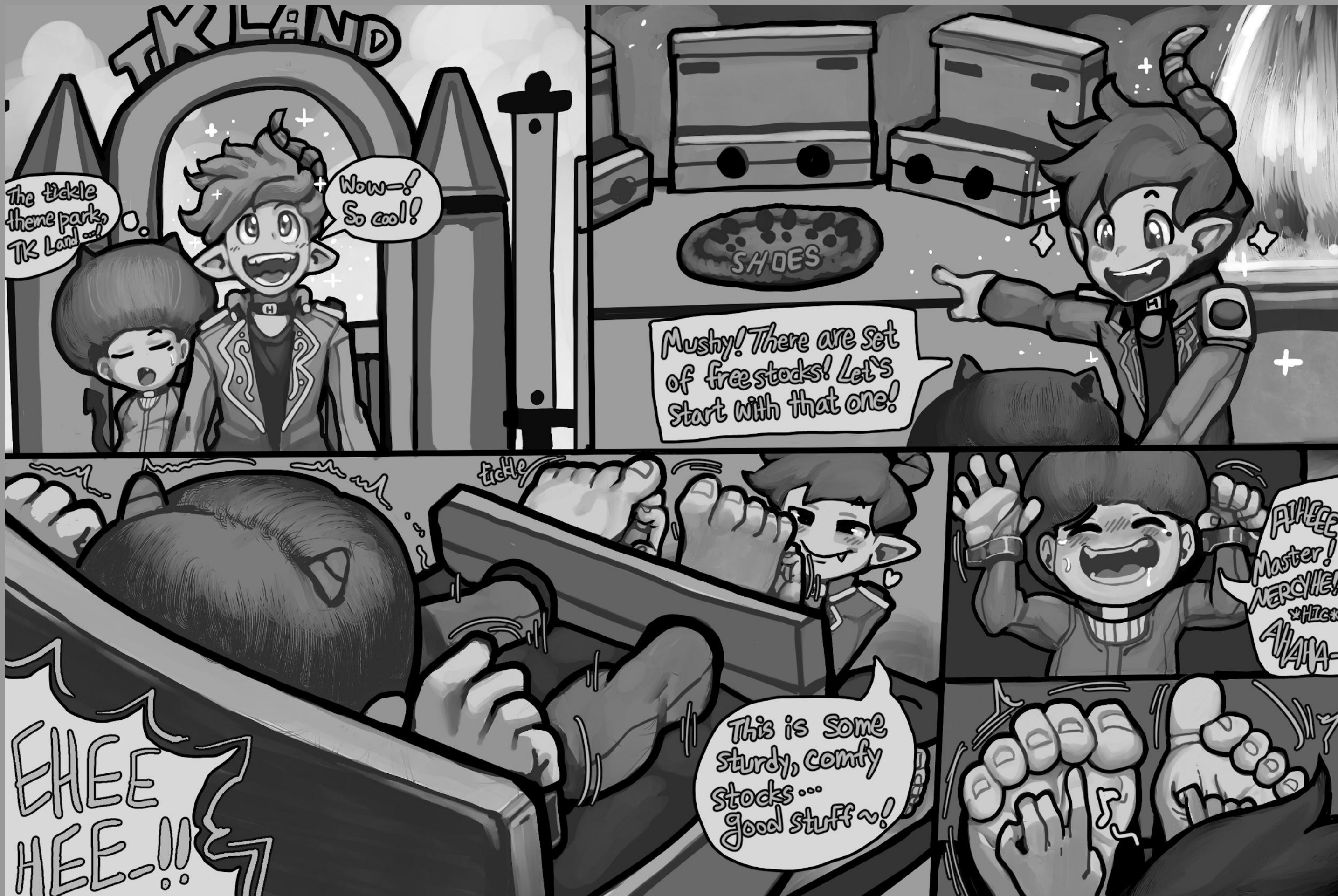
"Hey Master, what are those?" Mushy asked me while he pointed at some big wooden structures. There were people sitting on the structures, and some other people tickling their feet.