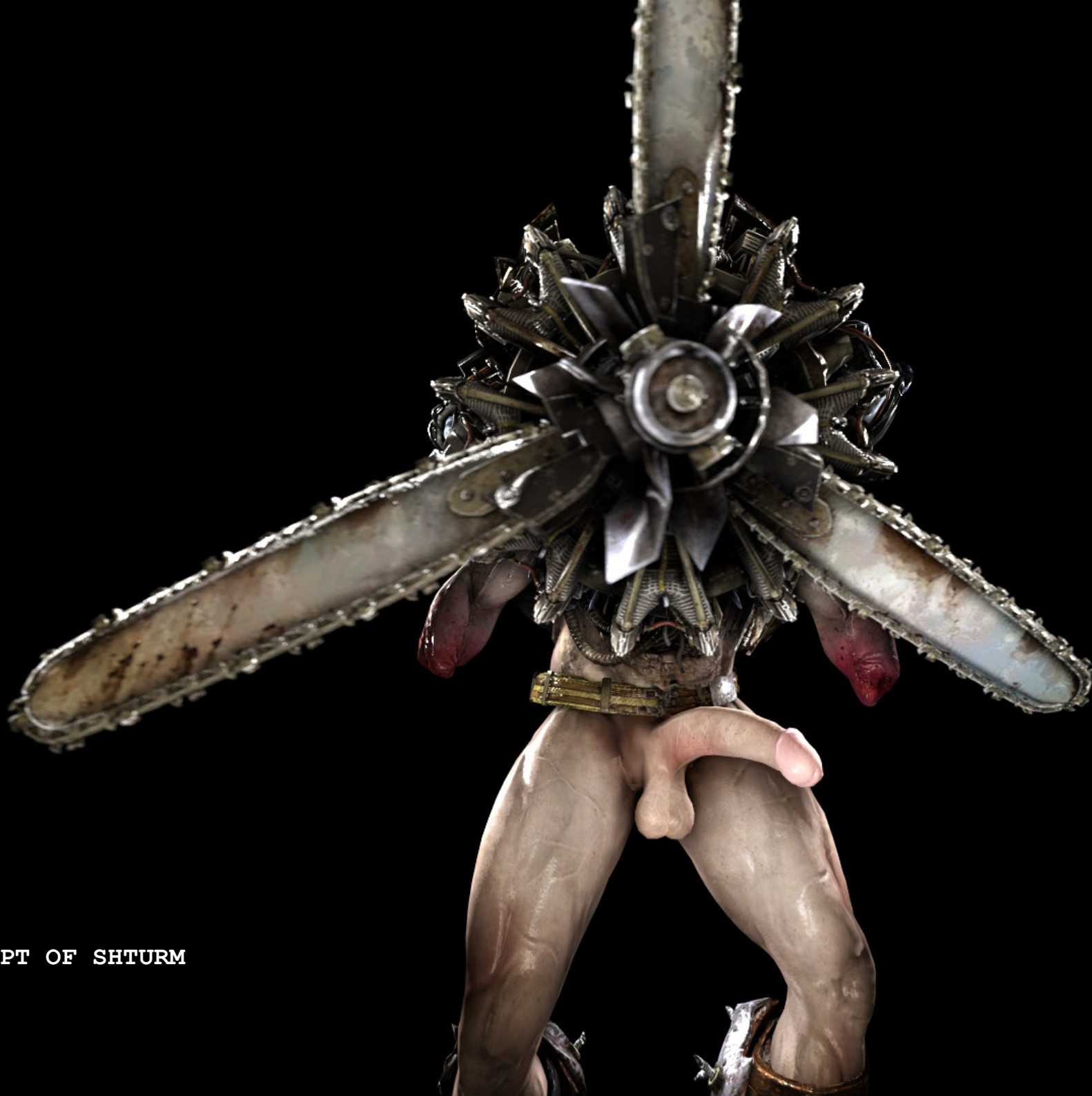
CONCEPT OF SHTURM