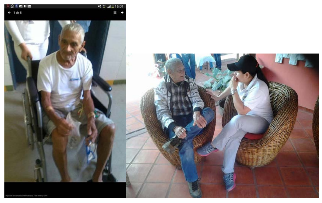
6 Months later!