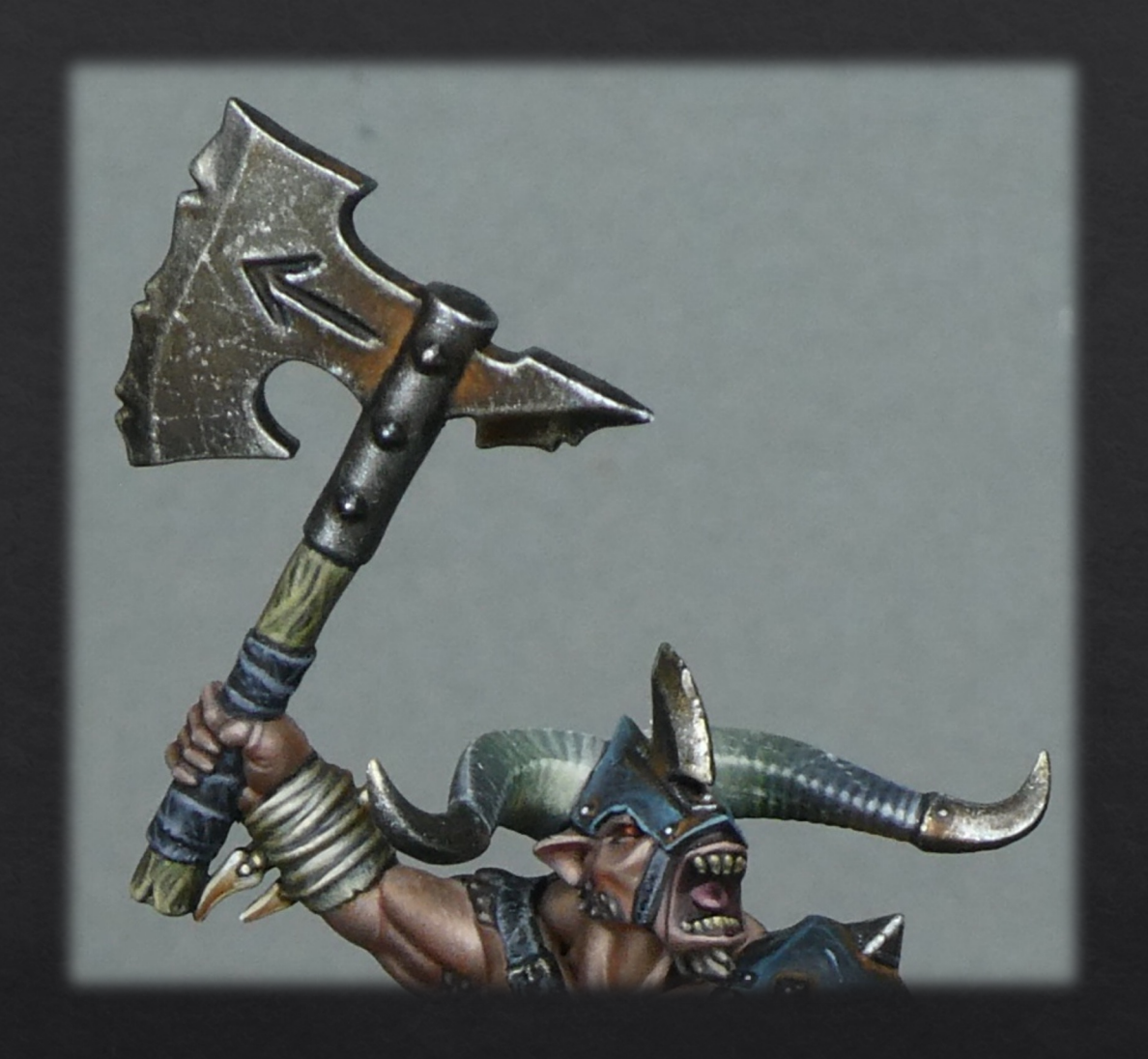
Beastman TMM rusty axe PDF tutorial