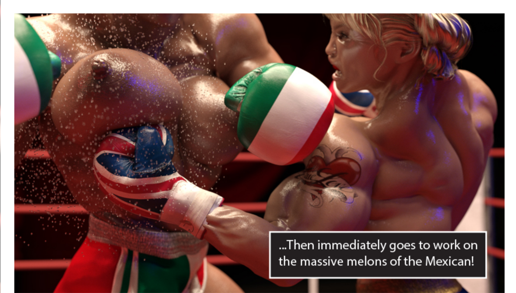
...Then immediately goes to work on the massive melons of the Mexican!