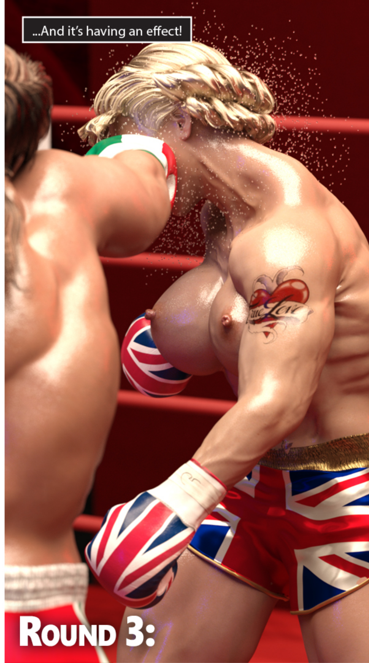
...And it's having an effect!