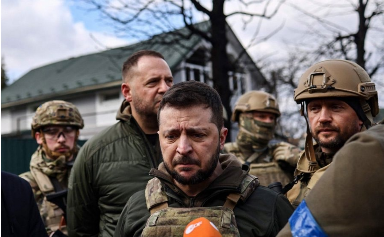
Photo Credit: AFP, Anadolu Agency/Getty Images (we're little guys and we don't distribute this widely – this image was critical share – please don't sue us)

United States President Joe Biden called for a trial to judge war crimes in Ukraine. 61