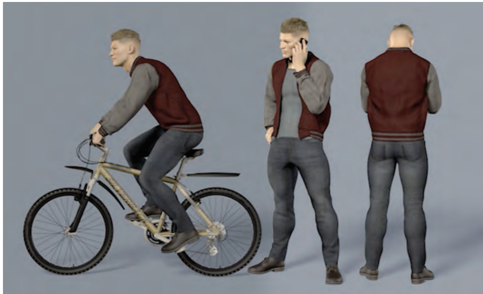
Some test renders.

series, I tried to show the encounter between the two in a less explicit and more romantic and erotic way. For this series of around 100 images, there're 78 different poses for the main character alone.