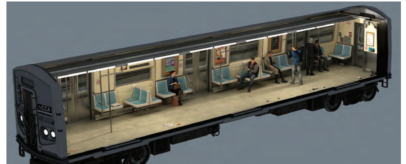
Some test renders.