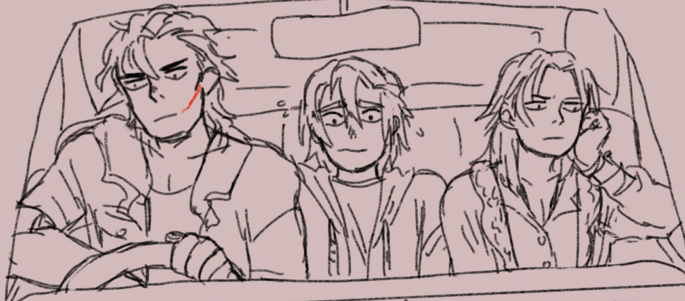
WORLD'S MOST AWKWARD ROAD TRIP