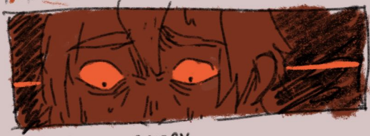
A BAD MEMORY