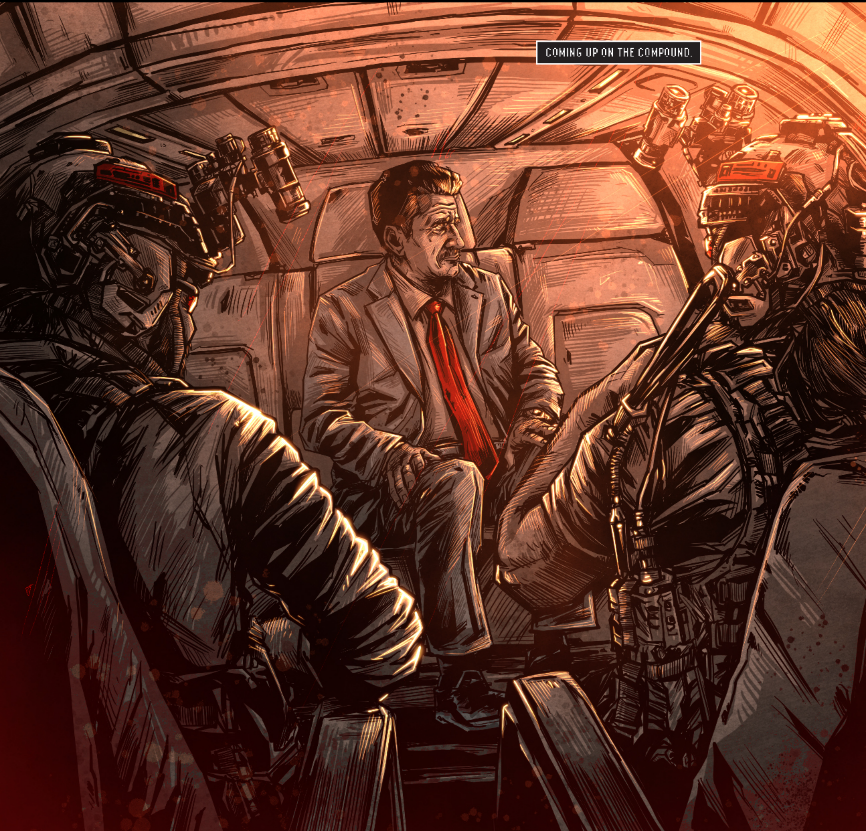
COMING UP ON THE COMPOUND.