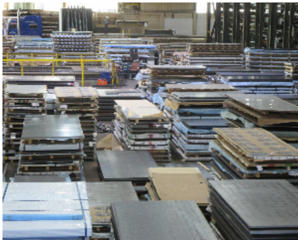
Metal shop - I imagined an open warehouse, function over looks.