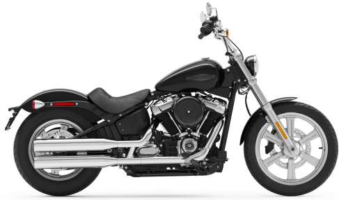
The first motorcycle he sold