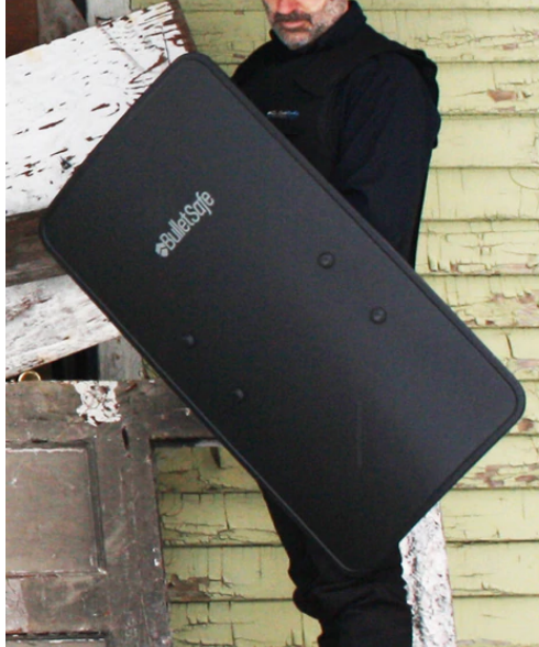
This is the ballistic shield

The extension of the shield has a look like a combination between the briefcase armor in iron man 2 with a more goop feeling. Things unfold, touch and seem to meld together, like how holes fill in when you play with oobleck.